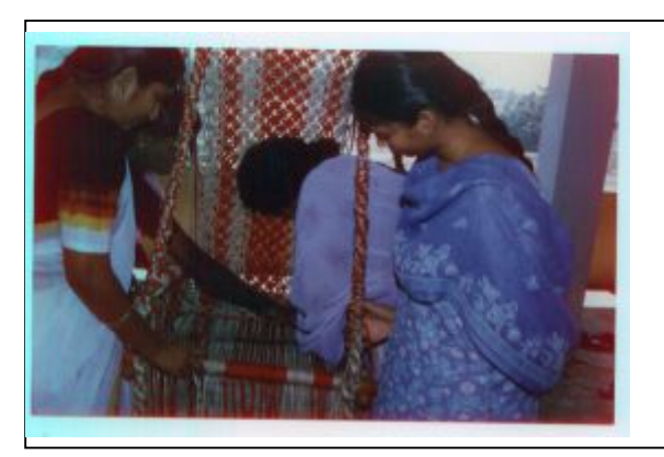
Jute Handicrafts making