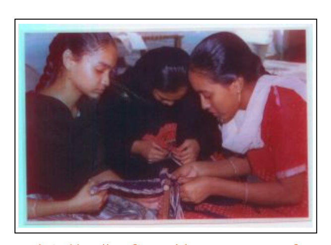
Jute Handicrafts making programme for minorities in progress